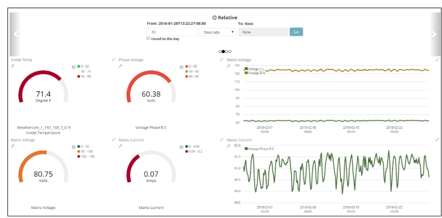
SMC Cloud Dashboard